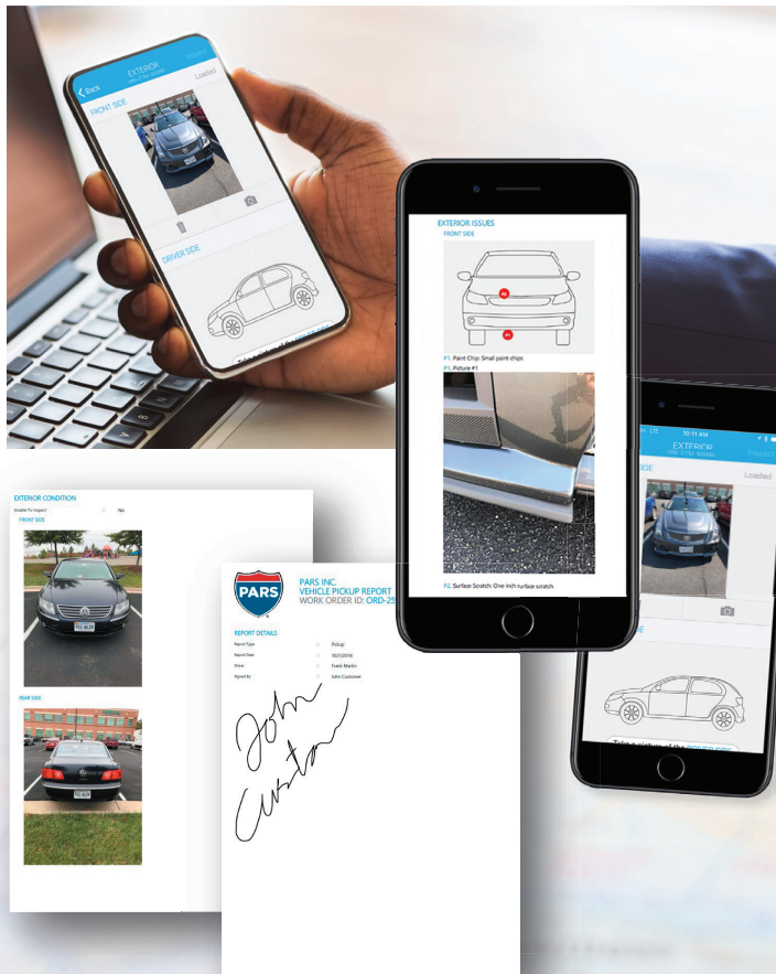
THROUGH PARS MOBILE APP DRIVER PROVIDES REAL-TIME UPDATES